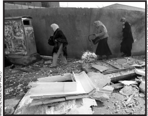
Iraqi women walk past wreckage from a roadside bomb on Jan. 10, 2007.

Far from creating a secure, prosperous and democratic country, the U.S. invasion and occupation has destabilized Iraq. In a University of Maryland poll released in September 2006, 78 percent of Iraqis told researchers that the U.S. military presence is "provoking more conflict than it is preventing"; 71 percent said they want U.S. troops out within a year; and 61 percent think that a U.S. withdrawal will improve day-to-day security for average Iraqis. We should listen to them.