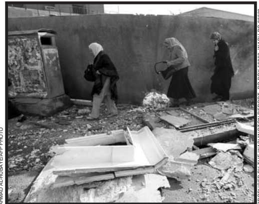
Iraqi women walk past wreckage from a roadside bomb on Jan. 10, 2007.

Far from creating a secure, prosperous and democratic country, the U.S. invasion and occupation has destabilized Iraq. In a University of Maryland poll released in September 2006, 78 percent of Iraqis told researchers that the U.S. military presence is "provoking more conflict than it is preventing"; 71 percent said they want U.S. troops out within a year; and 61 percent think that a U.S. withdrawal will improve day-to-day security for average Iraqis. We should listen to them.