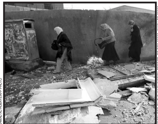
Iraqi women walk past wreckage from a roadside bomb on Jan. 10, 2007.

Far from creating a secure, prosperous and democratic country, the U.S. invasion and occupation has destabilized Iraq. In a University of Maryland poll released in September 2006, 78 percent of Iraqis told researchers that the U.S. military presence is "provoking more conflict than it is preventing"; 71 percent said they want U.S. troops out within a year; and 61 percent think that a U.S. withdrawal will improve day-to-day security for average Iraqis. We should listen to them.