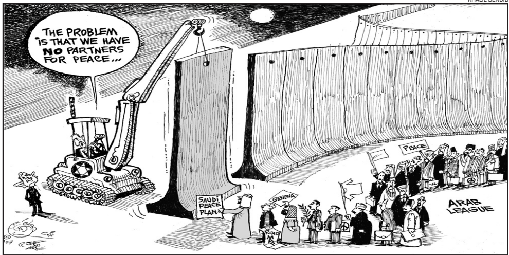
KHALIL BENDIB PRODUCED BY THE WASHINGTON REPORT, PO BOX 63082, WASH DC 20009

FROM: _____ Address: _____ City, State, Zip: _____