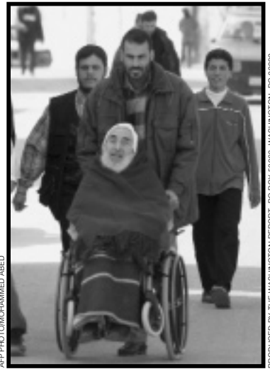
Sheikh Ahmed Yassin, the virtually deaf and blind paraplegic Hamas spiritual leader, going to a Gaza mosque to pray on Jan. 16, 2004.