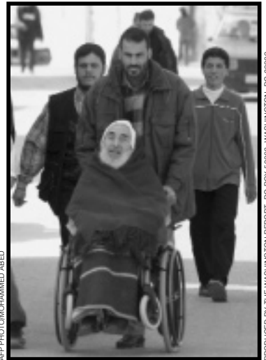
Sheikh Ahmed Yassin, the virtually deaf and blind paraplegic Hamas spiritual leader, going to a Gaza mosque to pray on Jan. 16, 2004.