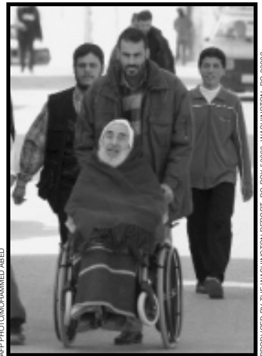
Sheikh Ahmed Yassin, the virtually deaf and blind paraplegic Hamas spiritual leader, going to a Gaza mosque to pray on Jan. 16, 2004.