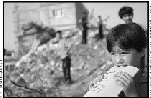
A Palestinian girl holds her school notebook in front of a house demolished by Israeli troops in the Gaza Strip town of Deir al-Balah, May 27, 2004.

Dugard has appealed for an arms embargo on Israel, citing the example of international action against Pretoria's apartheid regime.