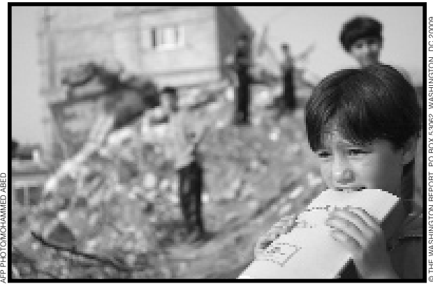
A Palestinian girl holds her school notebook in front of a house demolished by Israeli troops in the Gaza Strip town of Deir al-Balah, May 27, 2004.

Dugard has appealed for an arms embargo on Israel, citing the example of international action against Pretoria's apartheid regime.