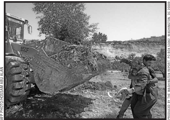
A Palestinian farmer is pulled out of the way as an Israeli bulldozer, enacting long-standing Israeli policy, uproots his olive trees to make way for a new settlers' road near Hebron, March 20, 2001.

Noted the Israeli human rights group B'Tselem, "the lack of [Israeli] law enforcement creates an atmosphere of disregard for the lives and property of Palestinians and encourages the continuation of such phenomena." The Israeli army has prohibited Palestinians from harvesting their crops, and has uprooted over 200,000 olive trees since October 2000, leading to $10 million in direct losses and the uncountable loss of future generations of olive harvests.