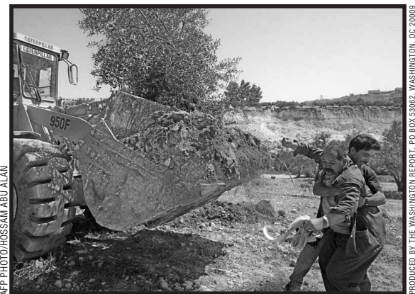
A Palestinian farmer is pulled out of the way as an Israeli bulldozer, enacting long-standing Israeli policy, uproots his olive trees to make way for a new settlers' road near Hebron, March 20, 2001.