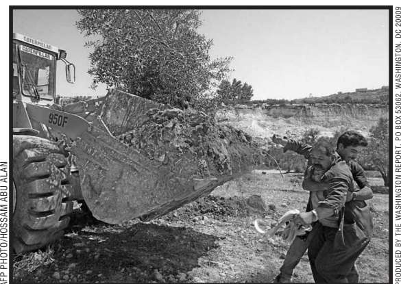
A Palestinian farmer is pulled out of the way as an Israeli bulldozer, enacting long-standing Israeli policy, uproots his olive trees to make way for a new settlers' road near Hebron, March 20, 2001.